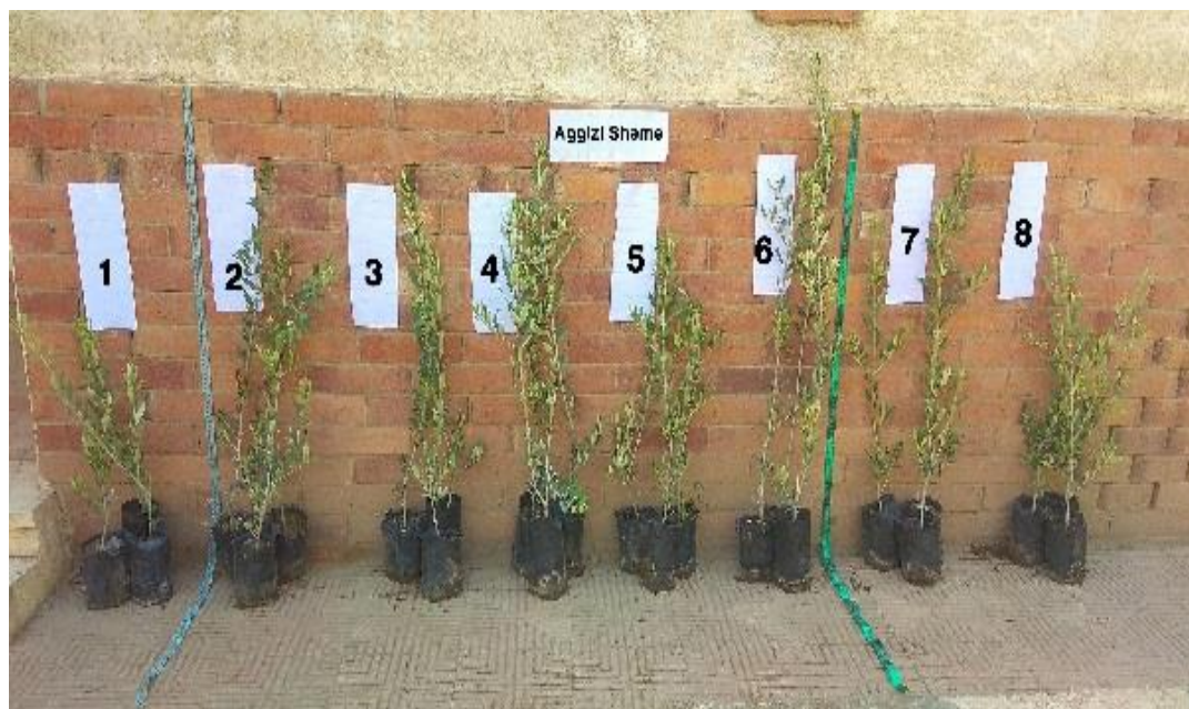
Fig. 6. The differences between treatments of Aggizi Shame cultivar at 2021/2022 season.