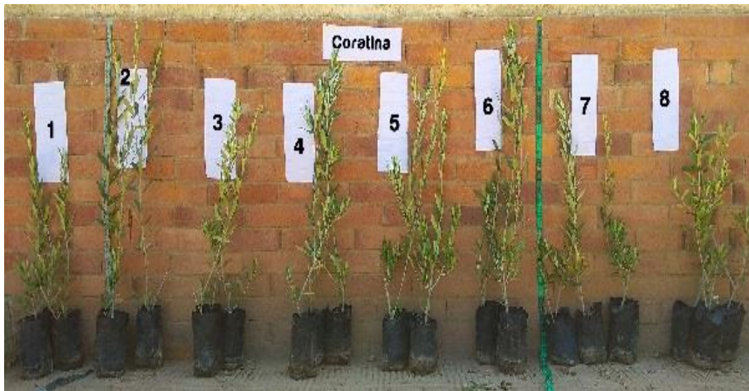
Fig. 5. The differences between treatments of Coratina cultivar at 2021/2022 season.